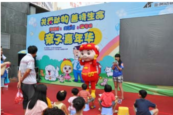
Left: Children listened to the “Care for animals” course very carefully with GG Bond.