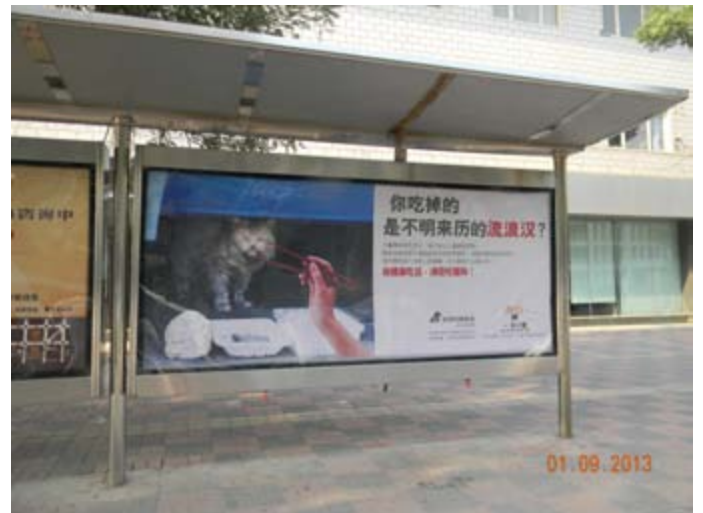
Bus station advertisements in Changsha, Hu'nan province and Shijiazhuang, Hubei province.