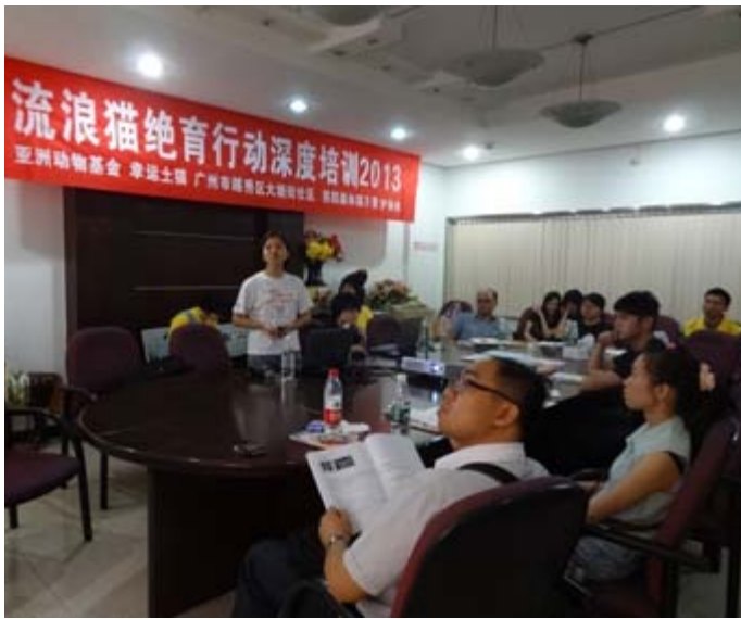
Left: Trainers share their experiences with Xixi Senlin Guangzhou Cat group. Right: Visiting a park in Shijiazhuang to see the TNR work.

We've learned that team building is as important as providing TNR skills, so trainers from Beijing welfare group Lucky Cats, shared their experiences with Xixi