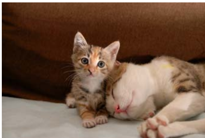
Winner: "Most touching eyes"