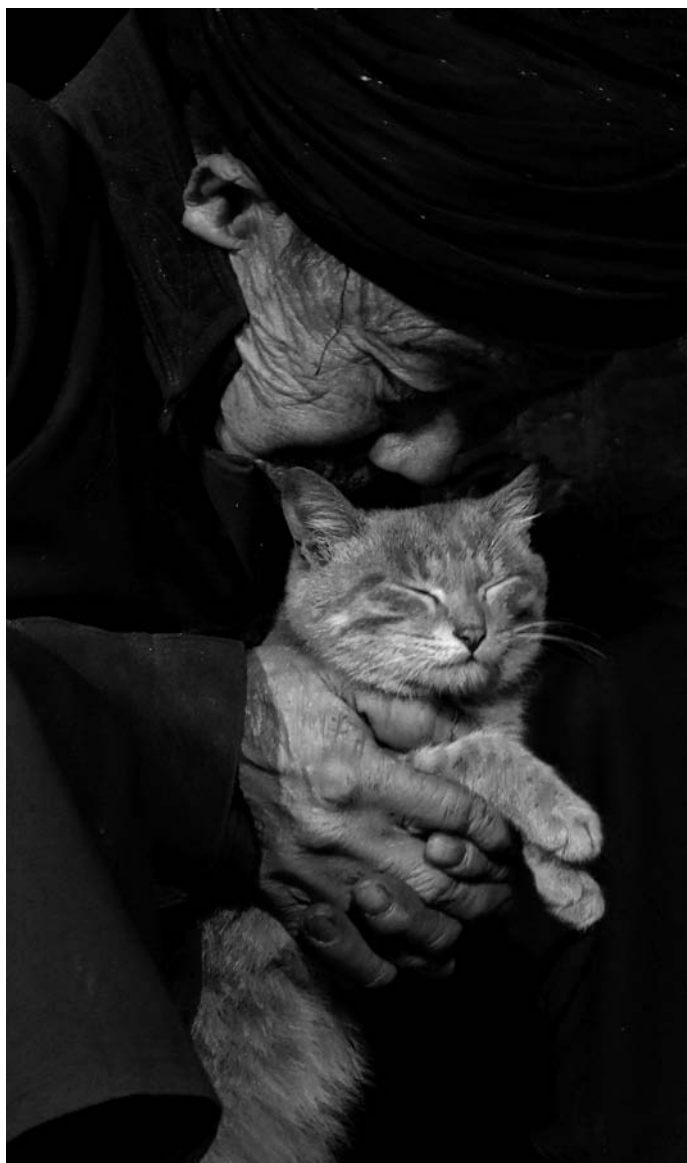
Winner: "We are a family"

Our winning photo exhibitions are running throughout China from October to December, raising