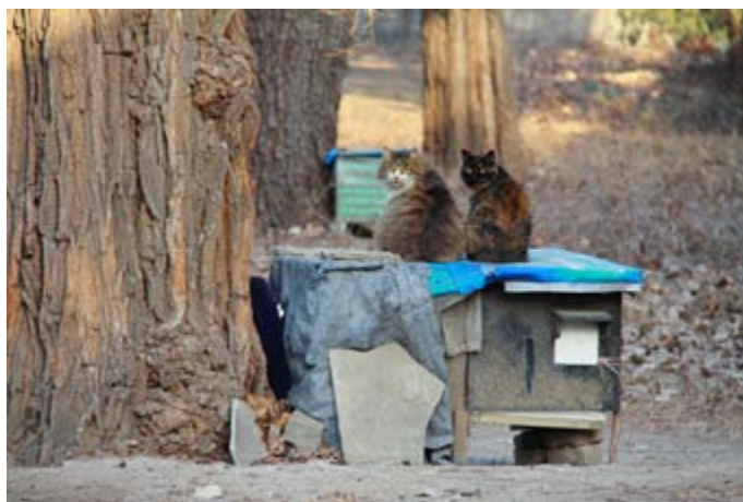
Winner: "Stray angels"