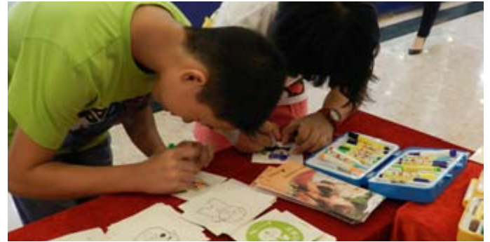
Right: The children loved making friends with animals through interactive game playing.