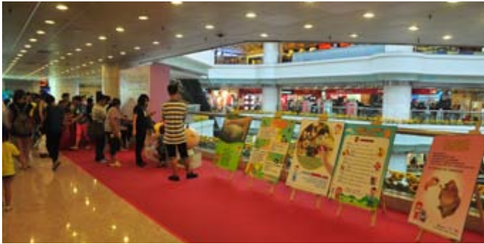
Left: “Care for Animals” posters shown in Teemall

Through the “Care for Animals” course, our volunteers showed the public how dogs can help us, how to get along well with animals and how to be a responsible companion animal owner. The children listened very carefully and asked some interesting