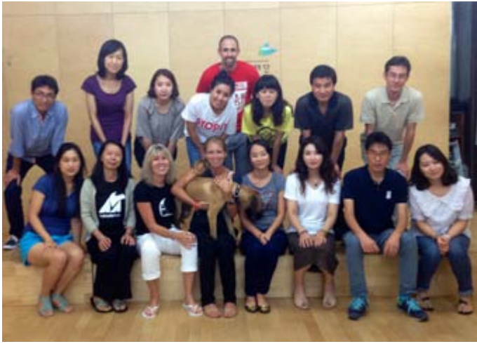
Left: "Django", a dog saved from the dog meat industry in South Korea, attends the meeting. Right: The meeting participants.